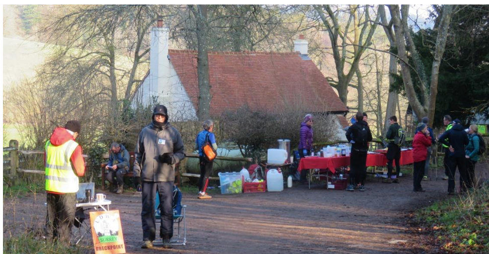
CP 3 at Tanners Hatch

Putting on the event was very much a team effort and that team (see last page) worked together to make it the tremendous event that it is. We really appreciate their efforts to make the event. Many thanks. We were also grateful to all at MatOrtho at Leatherhead who made every effort to welcome the event to their building. We also received very efficient service from Fabian4 who handled our entries.