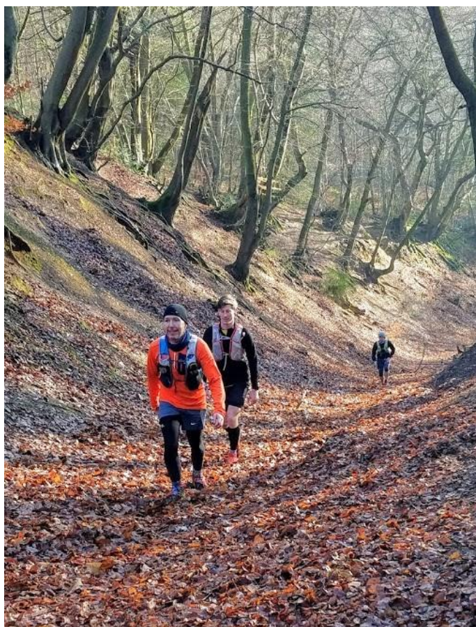
Ascending Jelly's Hollow towards CP2

We were pleased with the way that the PACER time recording system worked which gave us (and your on-line supporters) real time event information. This is now a mature system in which we have confidence.