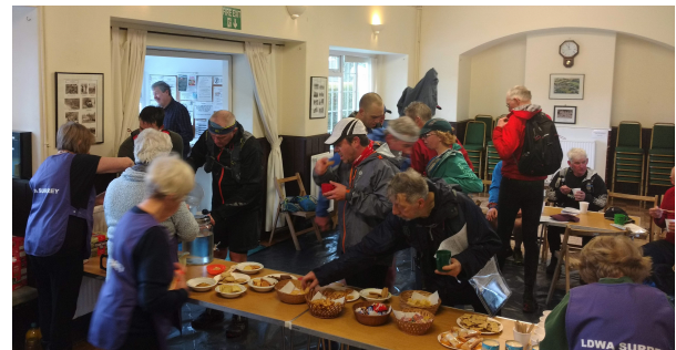
a busy CP2, The Sands Room ->

None of our challenge events could take place without the generous and enthusiastic help of our many Marshals. For myself and on behalf of all of you I would like to publicly record my thanks to each and everyone of them.